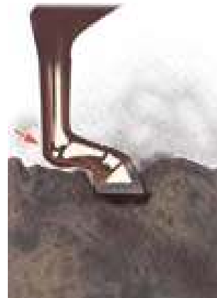
A surface that is too soft stresses the tendons.