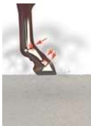
A surface that is too firm stresses the joints.

All products available from ProEquus® are purchased directly from the genuine, original manufacturers.